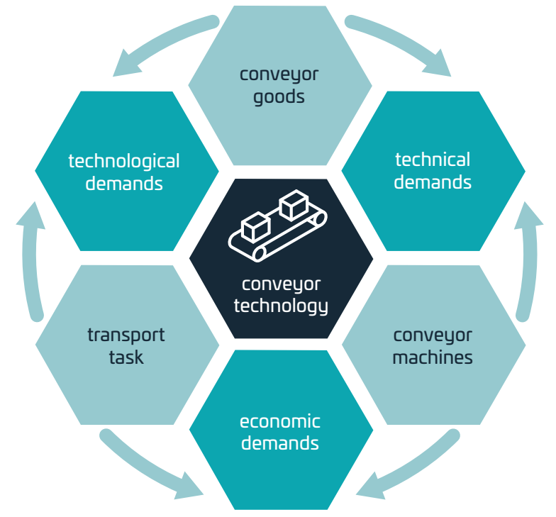
Figure 2 Dependencies of the areas of conveyor equipment (Griemert 2018 p. 2)

If a transportation task is solved by multiple conveyor machines, then the totality of the machines in connection with the information of the transport task is called a transportation or conveyor system. The interlinked conveyor machines can be of the same or different types and serve to fulfil a transport task. (Martin 2016, p. 100)